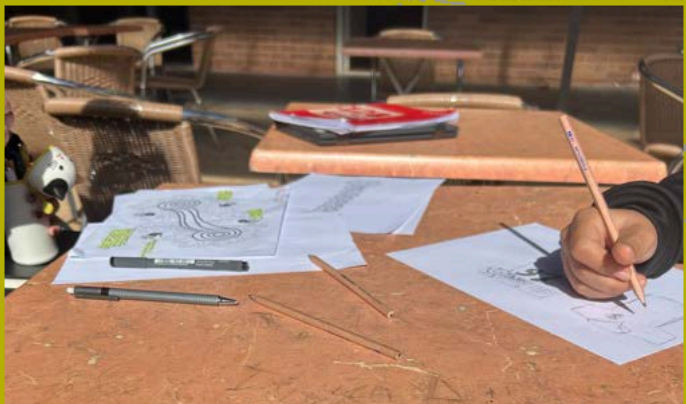
Designing the Year 10 Shirts